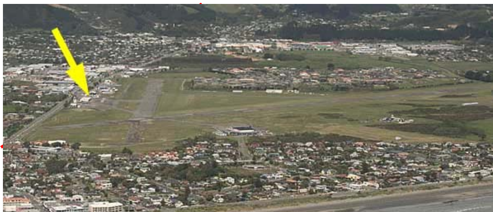
Paraparaumu Aerodrome (looking east)

The base at Paraparaumu airport provides a flexible flying environment. The climate on the Kapiti Coast is superb, meaning more flyable days per week. The close proximity of Wellington and Palmerston North allow easy access to a diverse range of airspace. All of this combines to provide a great variety of experiences for your training.